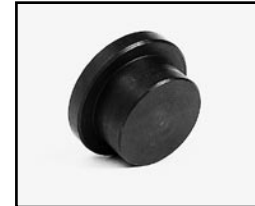
Fig. S103 — Ram Insert (Ferulok Only)