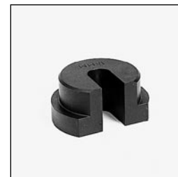
Fig. S106 — Nut Die Set

Dimensions and pressures for reference only, subject to change.