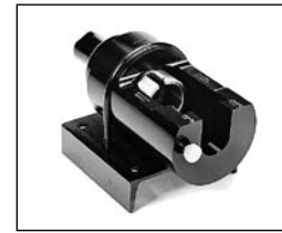
Fig. S102 — Hydra Tool